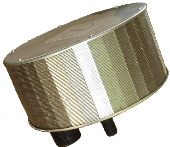
KS2.5 with standard wedge-wire