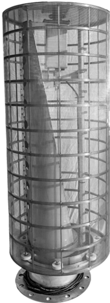
KSL12 Torq+ Electric Drive